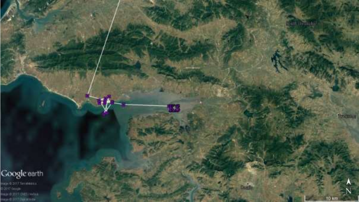
Fig 2. Mudflat area in South Hwanghae Province where KS stop-over