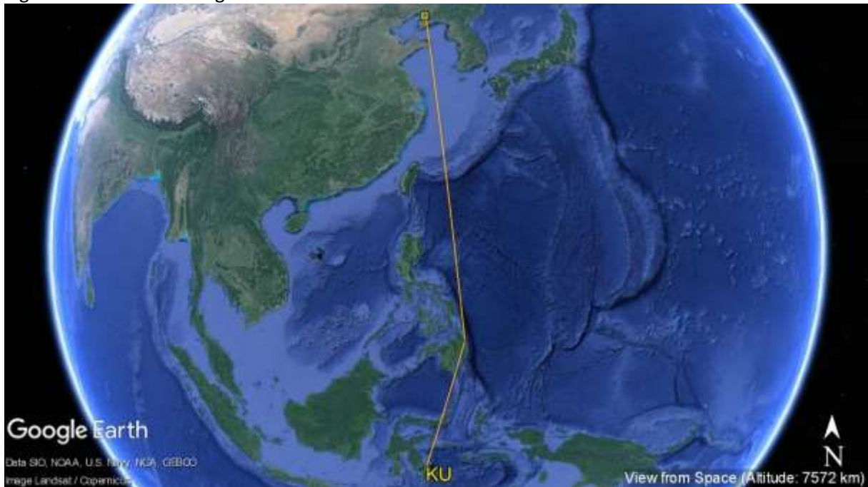
Fig 1: KU's southward migration from Yellow Sea to Sulawesi

To a surprise, KU joined KS to stop-over at South-east Sulawesi, they are only 60km apart from each other at the moment! It is amazing to see these 2 birds once again utilizing similar stop-over site. Earlier this year during the northward migration, these two birds reunion at the Yellow Sea in Panjin, Liaoning Province, sharing similar paddy field habitats just 50km apart from each other. Four and a half month later after successful breeding in Siberia, they reunion again in Sulawesi!