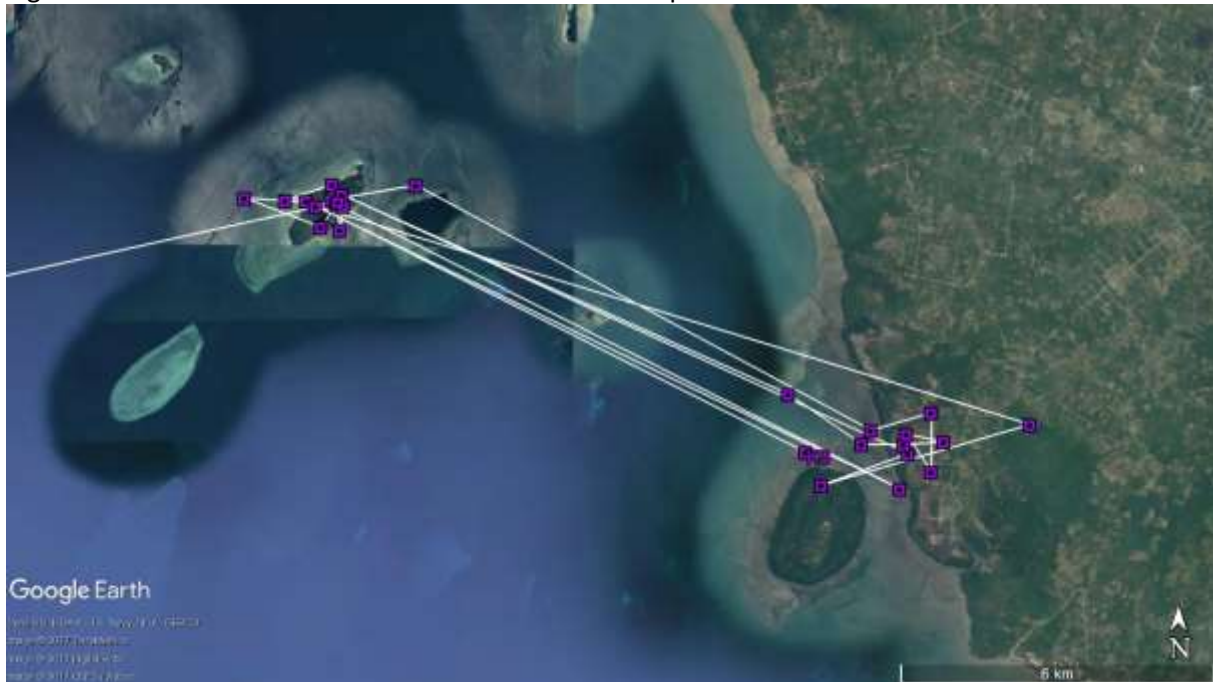
Fig 3: KS's movement between reefs and farmland in September at SE Sulawesi

Meanwhile, JX and LA are still doing very well at Roebuck Bay and Eighty Miles Beach respectively. At Roebuck Bay, JX regularly utilizes the Dampier Creek, West Quarry and the saltmarshes south of Crab Creek. Amazing that it has managed to escape from birders' eyesight since August. On the other hand, at Eighty Miles Beach, LA remains at its favourite patch of the beach 40-50km south of the Anna Plain station entrance.