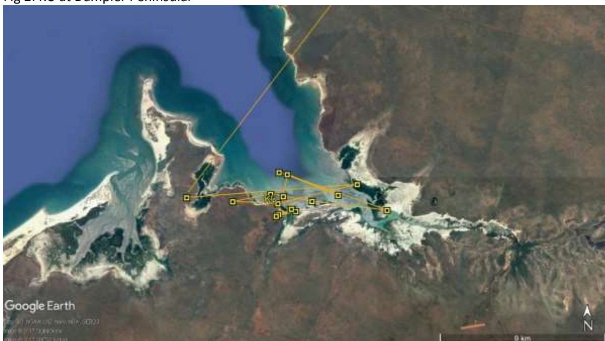
Fig 2: KU at Dampier Peninsular

Instead of heading back to Roebuck Bay in Broome, KU chose to stopover at Dampier Peninsular near Beagle Bay. It would be very interesting to see if it will finally come back to Roebuck Bay later in the season.