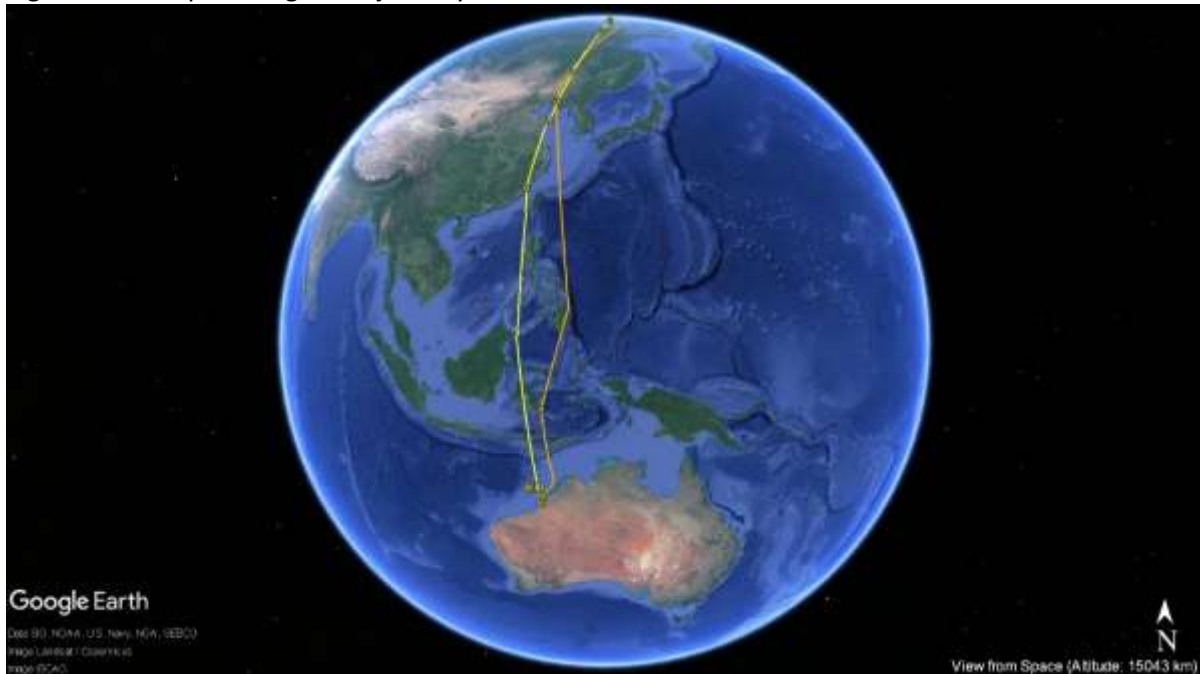
Fig 1: KU’s complete migration journey

Instead of heading back to Roebuck Bay in Broome, KU chose to stopover at Dampier Peninsular near Beagle Bay. It would be very interesting to see if it will finally come back to Roebuck Bay later in the season.